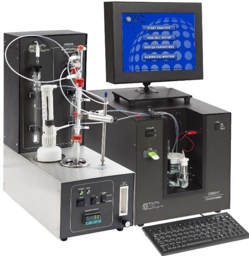
Figure 1: CM140 Total Inorganic Carbon (TIC) Analyzer